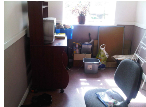
Communal landing being used as an office