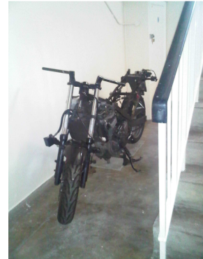
Motorbike in stairwell