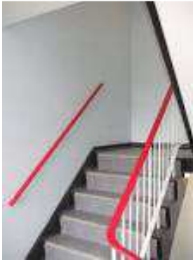
Well maintained communal areas